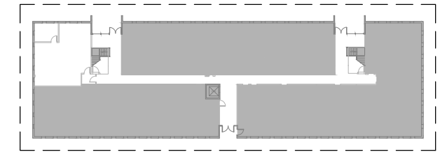
1 KEY PLAN 1 SCALE: NOT TO SCALE